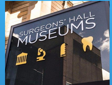
Surgeon's Hall Museums, Edinburgh

Explore the major historical epidemics of plague, cholera, typhus, smallpox and Spanish influenza