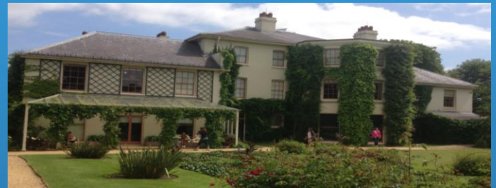
Downe House, Home of Charles Darwin

Explore the major historical epidemics of plague, cholera, typhus, smallpox and Spanish influenza