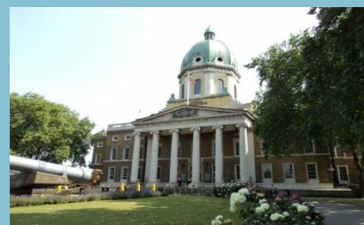
Former Site of Bethlem Asylum - London