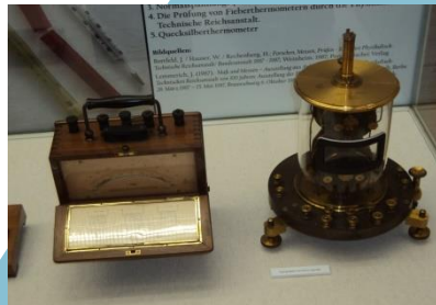
Psychology Museum at Wurzburg University