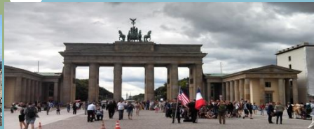
Brandenburg Gate - Berlin